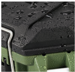
IP65 Water & Dust Protection

MULTI CRUISER is an interchangeable and interlocking modular storage system that's versatile, customisable and makes transporting of tools and equipment easy. MULTI CRUISER is constructed from rugged impact resistant material to withstand harsh environments and designed to provide users extra flexibility and tool protection. MULTI CRUISER offers a growing range of inner trays, cases, and accessories to support a wide range of configurations to suit your storage transportation requirements.