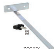
302691 Guide Optional Accessory