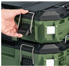
Heavy-duty Large Latch System

Durable construction designed to protect contents against harsh elements