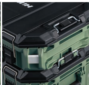
Quick Secure Stacking Latches

Creates a water tight seal against dust, soil, water and rain