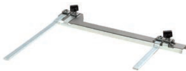
380742 Guide Rail Adaptor Optional Accessory